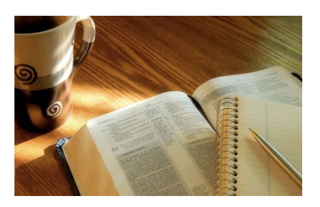
From the Pastor's Desk.

"I will put enmity between you and the woman, and between your offspring and her offspring; he shall bruise your head, and you shall bruise his heel." Genesis 3:15