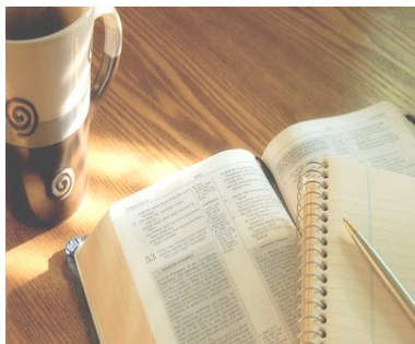
From the Minister's Desk

The Bible explains also that God's purposes are not always clear to human beings. It may be that the human mind cannot apprehend the unfolding of God's plan in this world.