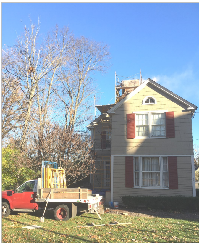
The manse chimney received some maintenance and repair to the brickwork.